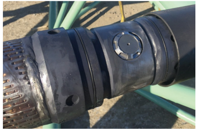
Figure 2: AICD completion