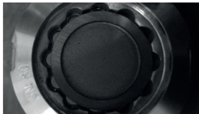
Free-floating 'non levitating' disc