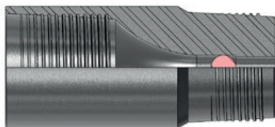
FloCheck Ball Seat Sub